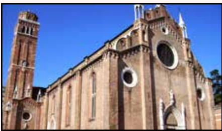
Basilica dei Frari

Venice is a city in north-eastern Italy and the capital of the Veneto region. It is situated on a group of 118 small islands that are separated by canals and linked by over 400 bridges. The islands are located in the shallow Venetian Lagoon, an enclosed bay that lies between the mouths of the Po and the Piave rivers (more exactly between the Brenta and the Sile). In 2018, 260,897 people resided in the Comune di Venezia, of whom around 55,000 live in the historical city of Venice. Together with Padua and Treviso, the city is included in the Padua-Treviso-Venice Metropolitan Area (PATREVE), which is considered a statistical metropolitan area, with a total population of 2.6 million.