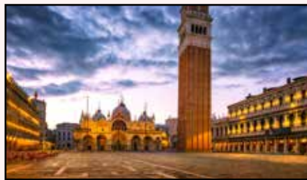
St. Mark's Square