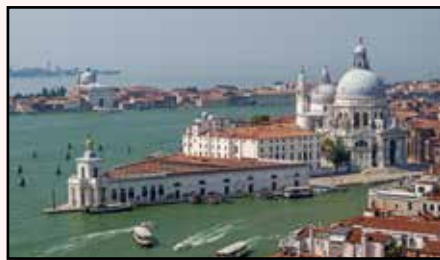
Basilica di Santa Maria della Salute