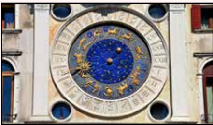
St Mark's Clocktower