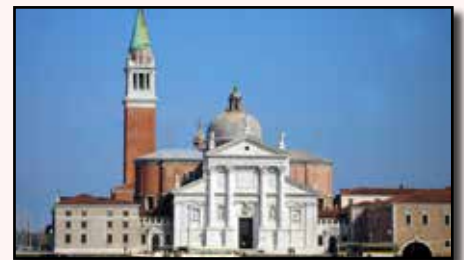
Church of San Giorgio Maggiore